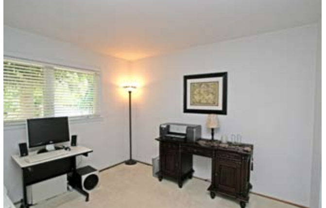
OPEN HOUSE SAT & SUN 1:30-4:30 PM