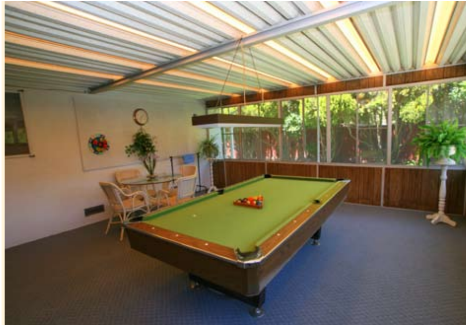
Spacious Screen Room with Pool Table