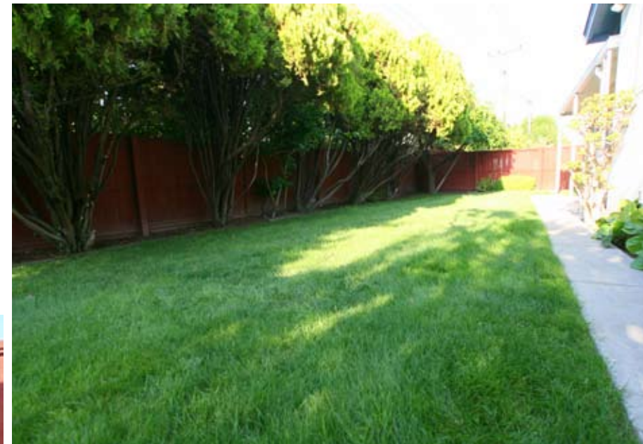
Exterior Backyard Flood Lights Front Yard Decorative Lighting