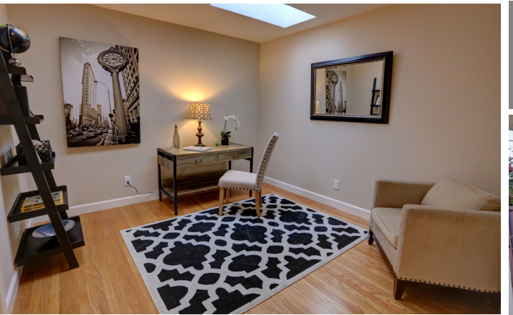
Property is conveniently located close to shopping, schools, and parks. Sutter Elementary School, Buchser Middle School, and Santa Clara High School.