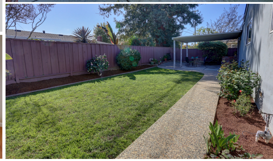
Backyard features lawn and covered patio with built-in BBQ plumbed for gas. Concrete walk ways around perimeter of home.