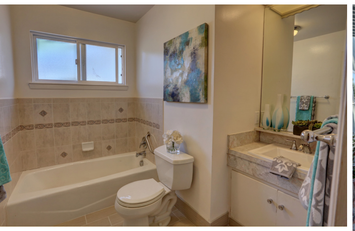
Guest bedrooms feature sliding door closets & hardwood floors. Guest bath has a tiled floor and tub enclosure