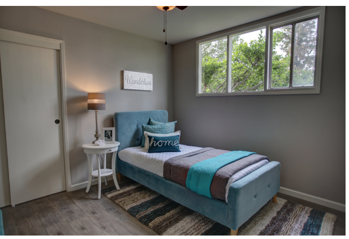
Guest bedrooms with water resistant 12mm laminate flooring, new baseboards and siding door closets.