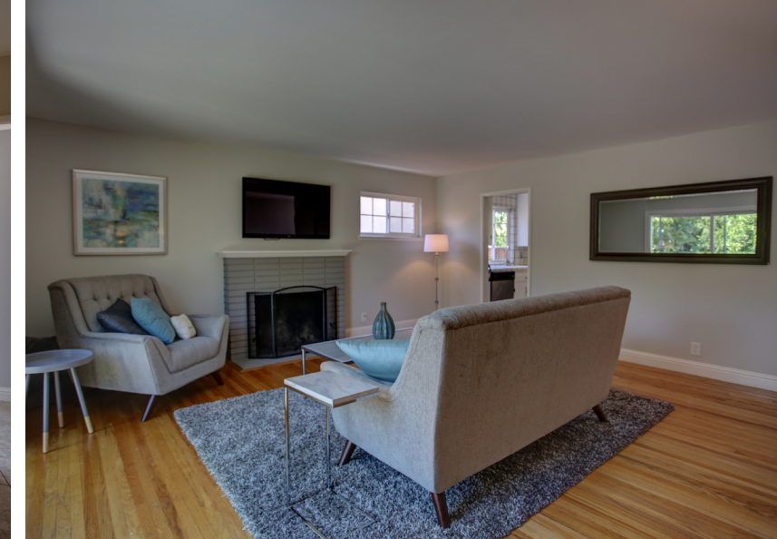
Spacious living room with refinished hardwood floors, fireplace and sliding door access to backyard.

3 Bedroom 2 Bath single family home with 1,212 Sq. Ft. of living area on a 5,353 Sq. Ft. lot. Spacious 2 car garage with automatic opener. Kitchen features solid wood cabinets with tiled counter tops, hardwood flooring and eat-in dining area with wainscoting trim on walls Kitchen includes electric range & oven, hood vent, refrigerator and dishwasher.