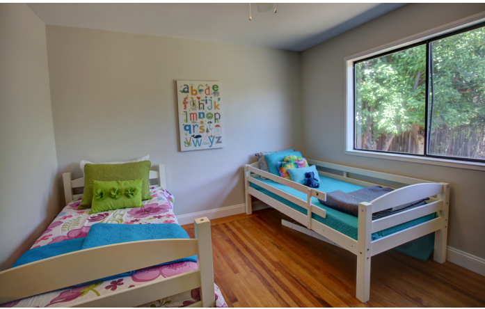
Property is conveniently located to Lawrence Expy, shopping, schools and parks. Briarwood Elementary, Cabrillo Middle School and Wilcox High School