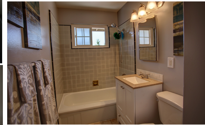
Bright master bedroom with mirrored closet door, ceiling fan and private bath. Bath features tile stall shower and quartz vanity.