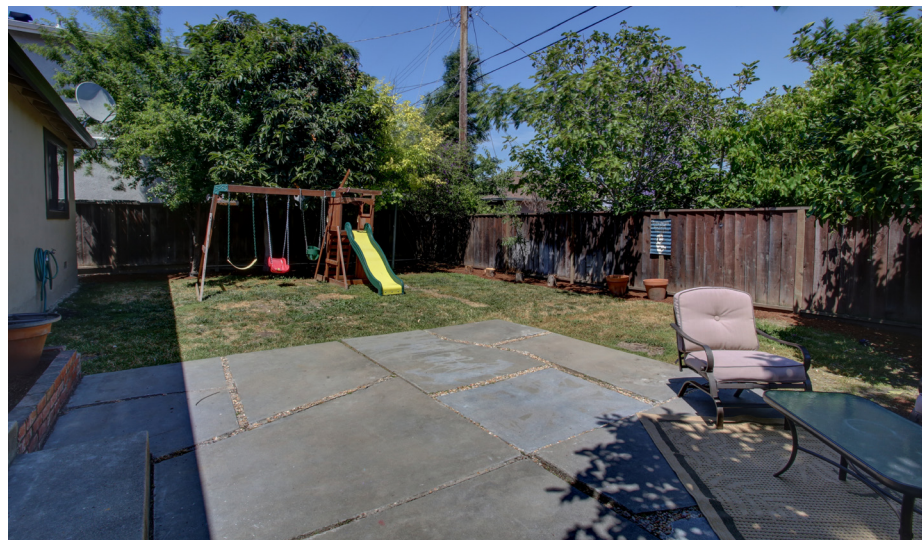
Backyard has mature fruit trees, kids play structure, concrete patio and access to living room.