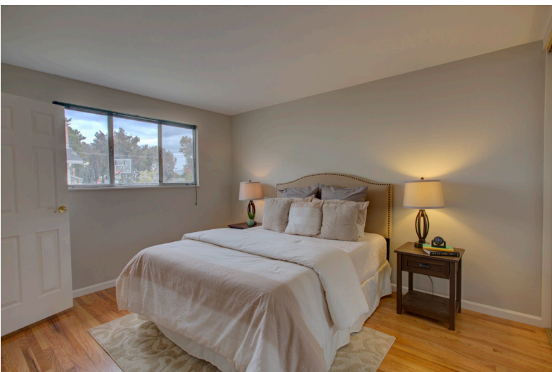
New Gutters New Roof (40 year) Hardwood floors throughout Wood Burning Fireplace Centralized AC and Heating LED Recessed Lighting 2 Car Garage w/ Automatic Opener

3 Bedroom 2 Full Bath single family home with 1,170 Sq. Ft. of living area on a 6,852 Sq. Ft. lot. 2 car garage w/ automatic opener. Charming home with great potential in established Darvon Park neighborhood features natural light and hardwood floors throughout. U shaped style kitchen features ample counter and storage space, vinyl flooring, dining area, and sliding glass door to backyard.