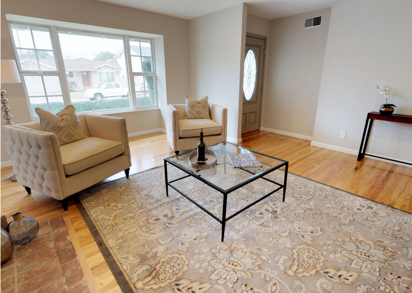
Bright and open family room features wood burning fireplace, double hung bow window, and LED recessed lighting.