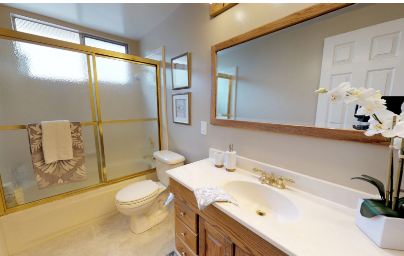
Cozy master retreat with large walk-in closet and master bath. 2 full bathrooms feature tile flooring and tiled shower stalls.