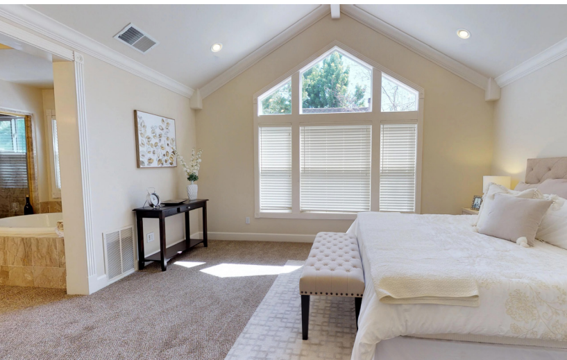
Spacious master retreat with floor to ceiling windows, large walk-in closet with closet organizer, and luxurious ensuite with dual vanity, stall shower, and deep soaking tub.