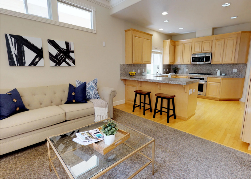
Bright and open family room features gas fireplace, double hung bow window, and LED recessed lighting.