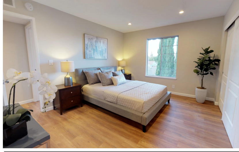
Spacious master suite with large closet and private bath. Full bath features large vanity with ample storage, shower with tile surround, new fixtures, and tile floors.