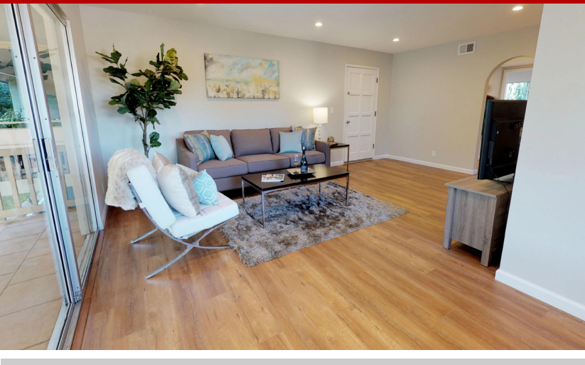
Bright & open living room w/ LED recessed lighting & sliding doors to private balcony. Updated kitchen features quartz countertops, subway tile backsplash & stainless steel appliances.

2 Bedroom 2 Bath 1,067 Sqft. Condo End Unit with Private Balcony Cupertino Schools (Eisenhower, Hyde, Cupertino) 1 Assigned Carport and Extra Storage Closet In-Unit Laundry Utility Room Forced Air Heating Whirpool Stainless Steel Appliances Community Pool and Clubhouse