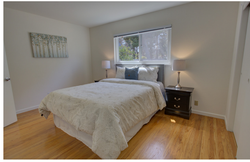
Spacious master with dual sliding door closets, and ensuite. Master bath features tiled stall shower, tile floors, and wood vanity.

Dual entry hall bath features tile flooring, tiled shower stall with bathtub, and vanity with storage.