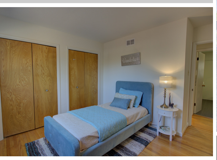
Guest bedrooms feature hardwood flooring and large closets.