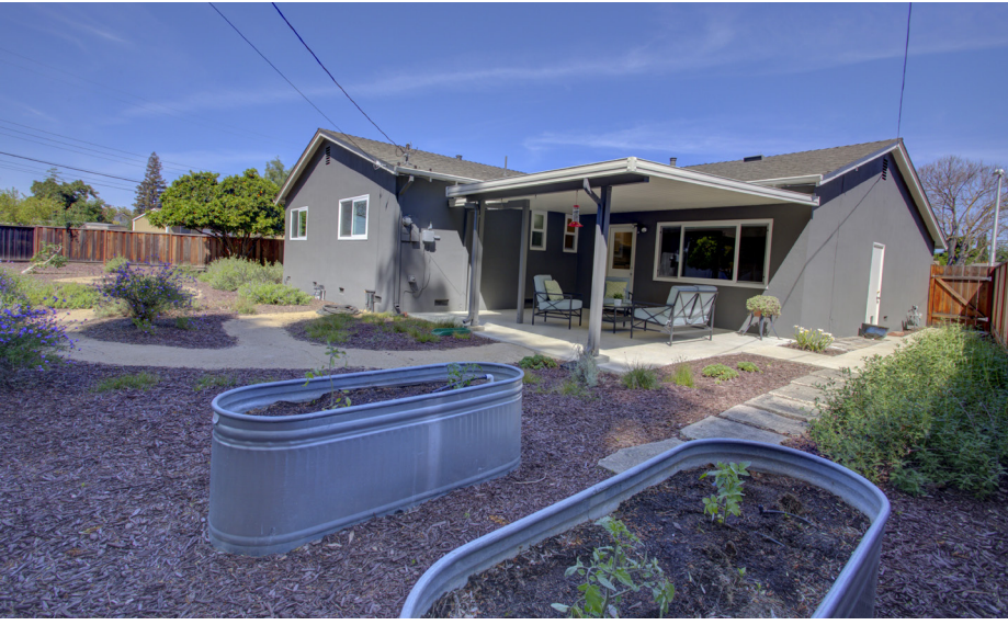
Expansive backyard features irrigation drip system on an automatic timer, lemon trees, and planter boxes. Lot size can accomodate addition or detached accessory dwelling unit (ADU).