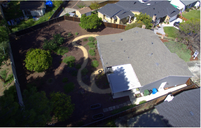
Property is conveniently located next to parks, schools, freeways Santa Clara Schools: Westwood, Buscher, and Santa Clara. A few miles from new Apple Campus, Santana Row, and Valley Fair.