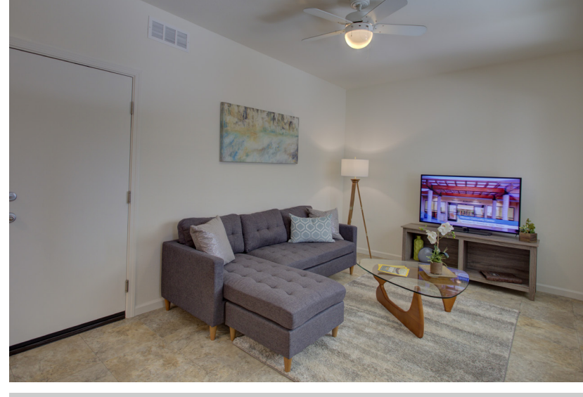
Separate family room with views and access to patio and backyard.

Milagard Dual Pane Windows Covered Patio Oak Hardwood floors Variety of Fruit Trees Low Maintenace Landscaping Wood-burning Fireplace Centralized Heating LED Recessed Lighting 2 Car Garage w/ Automatic Opener