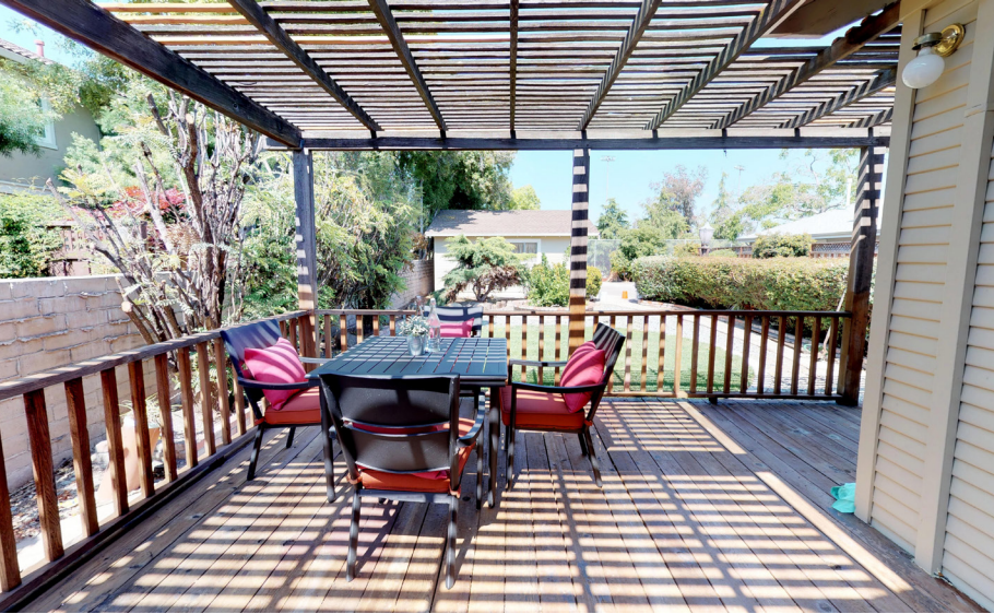
Beautiful backyard features large covered deck/porch with access to basement. Porch leads to grassy area and oversized detached garage.