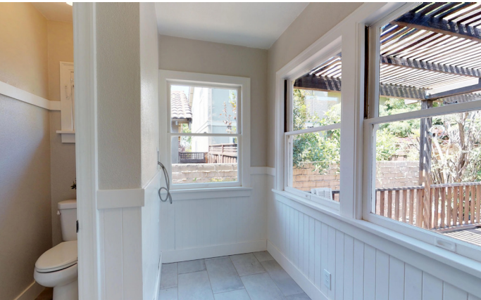
Property is conveniently located next to parks, schools, freeways Santa Clara Schools: Westwood, Buchser, and Santa Clara. A few miles from Santana Row, Valley Fair Mall, and new Apple campus.