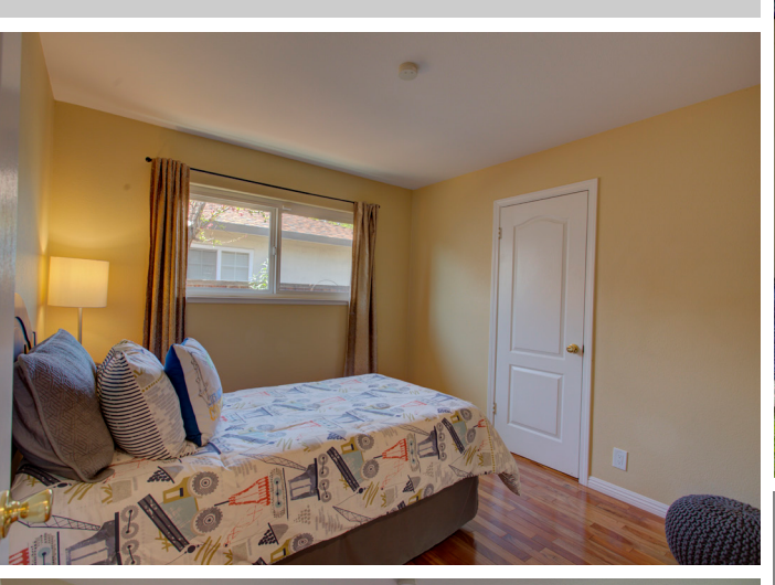
Guest bedrooms feature hardwood flooring, raised panel doors and large closets.