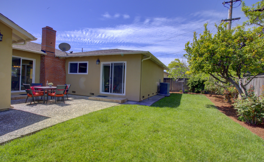
Expansive backyard features peach, lemon, apricot, apple, two different types of fig (regular & Portugese) trees, and a grape vine. Front yard features well-maintained landscaping, step stone walkway to front door and picturesque front porch.