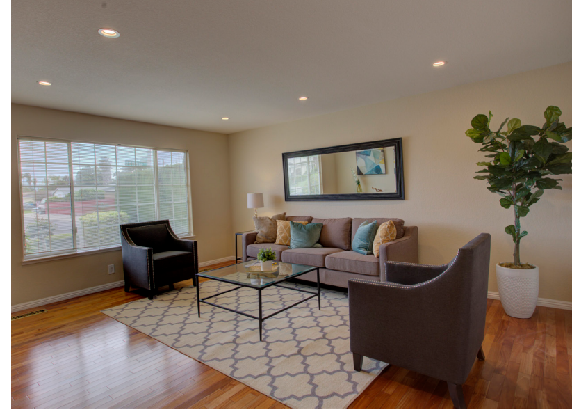
Bright and open family room features woodburning fireplace, vaulted ceilings, and LED recessed lighting.

Milagard Dual Pane Windows and Doors Separate Wet Bar Finished garage with Built-in storage Indusparquet Brazilian solid hardwood floors Prolific Variety of Fruit Trees Wood-burning Fireplace Centralized AC and Heat LED Recessed Lighting 2 Car Garage w/ Automatic Opener