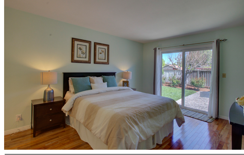
Spacious master with sliding glass door to backyard, dual closets, and ensuite. Master bath features large vanity with quartz countertops, mirrored closet doors, and stall shower.

Hall bath features tile flooring, tiled shower stall, and vanity w/ marbled countertop.