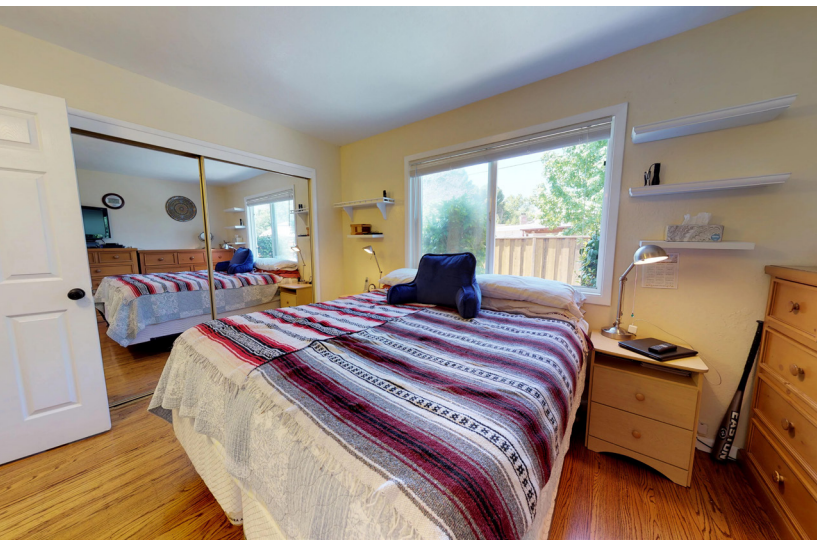
Master bedroom features large window and mirrored closet with attached ensuite. Ensuite features shower with tiled surround, tile flooring, large vanity and built-in shelves for extra storage.