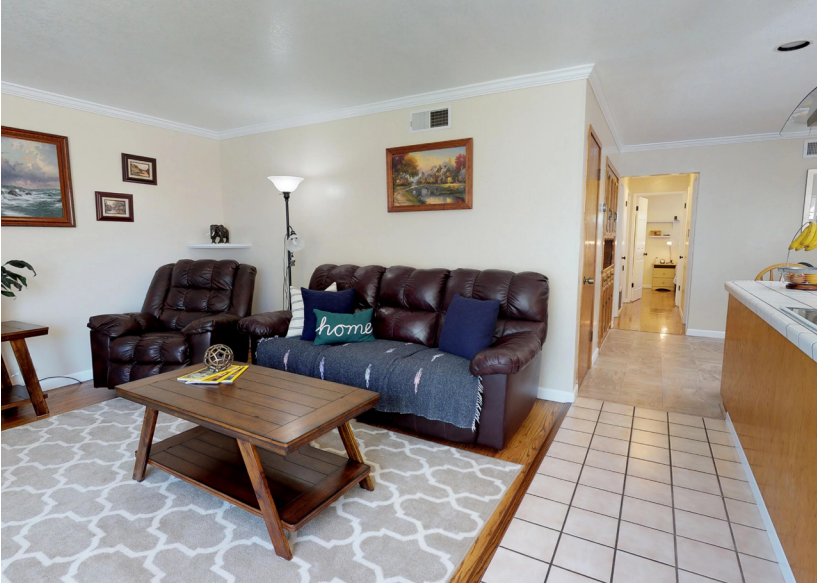
Spacious living room features woodburning fire-place, LED recessed lighting and sliding glass doors to backyard. Cozy family room features woodburning fireplace and large bay window.