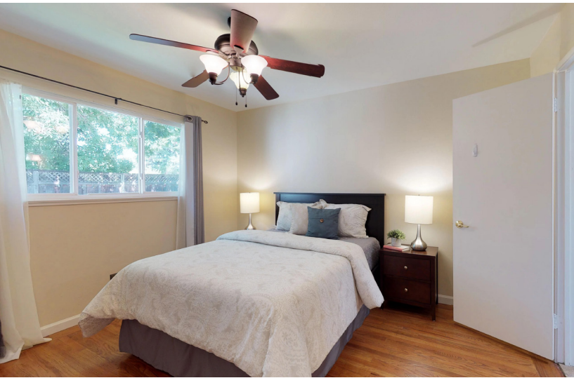
Cozy master bedroom features large custom closet, hardwood flooring, and ensuite.