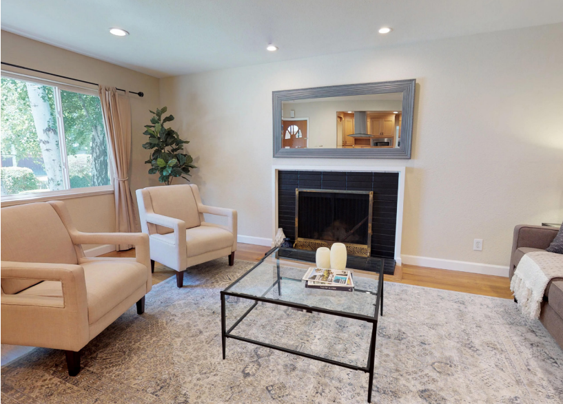
Warm and inviting living room opens up to updated kitchen and features woodburning fireplace and large window for plenty of natural light.