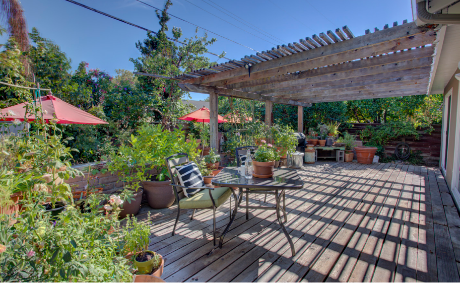
Serene and lush backyard features expansive deck with pergola overhang, thriving raised garden beds, and mature plants for added privacy.