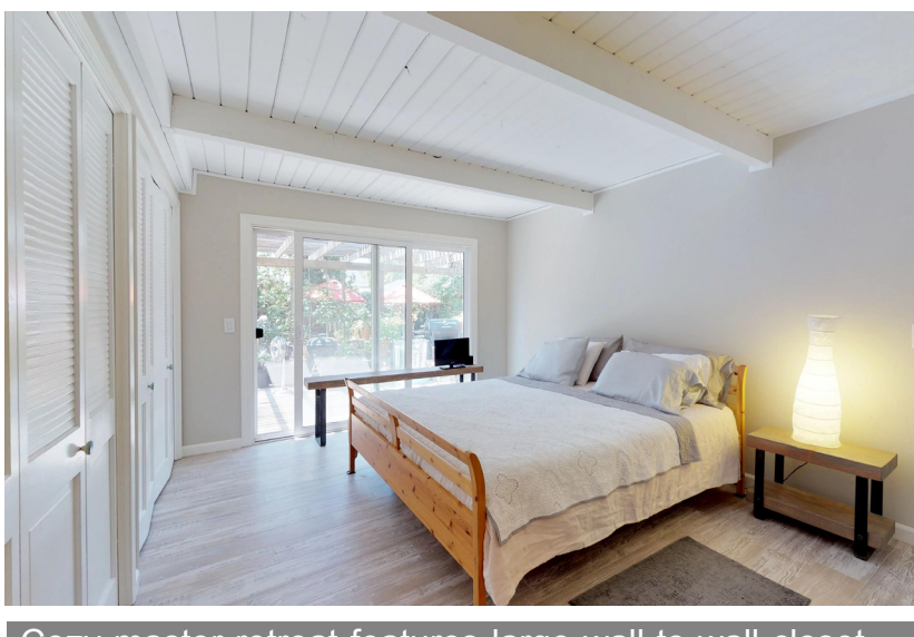
Cozy master retreat features large wall-to-wall closet, hardwood flooring, jack and jill bathroom, and sliding glass door to backyard deck.

Master bath features wood vanity with ample storage space and large stall shower with tile surround.