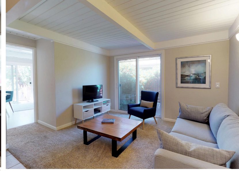
Inviting formal living room features woodburning fireplace and expansive window for added natural light. Cozy family/dining room combination has exposed plank ceiling and sliding glass door to side yard.

1 year old roof 2 car garage w/ automatic opener Wood burning fireplace Refinished Oak hardwood floors Central Heating Workspace with skylight LED recessed lighting Dual pane windows 4 sliding glass doors