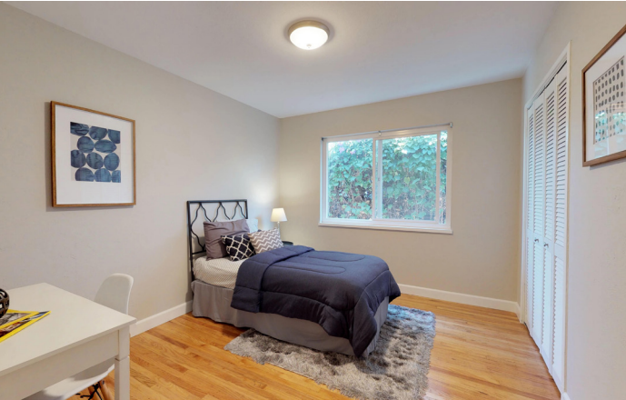
Property is conveniently located next to parks, schools, freeways, Santa Clara Schools: Sutter, Buchser, and Santa Clara. A few miles from Santana Row, Valley Fair Mall, and new Apple campus.